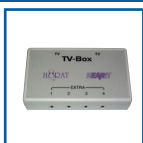
890-88-622-00 TV box to connect up to four Hearit to the TV