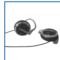
890-88-616-00 headphones on the