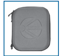
895-88-044-00 bag for Hearit MT and headset