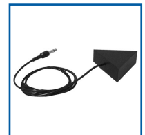
890-15-141-00 conference microphone