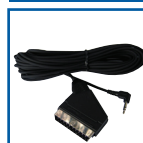
392-88-103-00 scart cable to connect Hearit to TV (8 m)