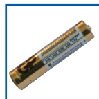
AA batteries 2 pcs are