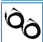
Connecting cable to TV box 2 x 1,5 m