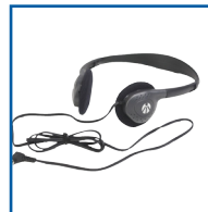
890-88-629-00 standard headphones