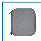
bag for Hearit MT and headset