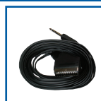
392-88-107-00 scart cable to connect TV box to TV